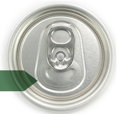
202 ISE - LOE Large Aperture